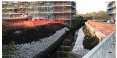
Before and after JK clearance - Timperley site, Cheshire.